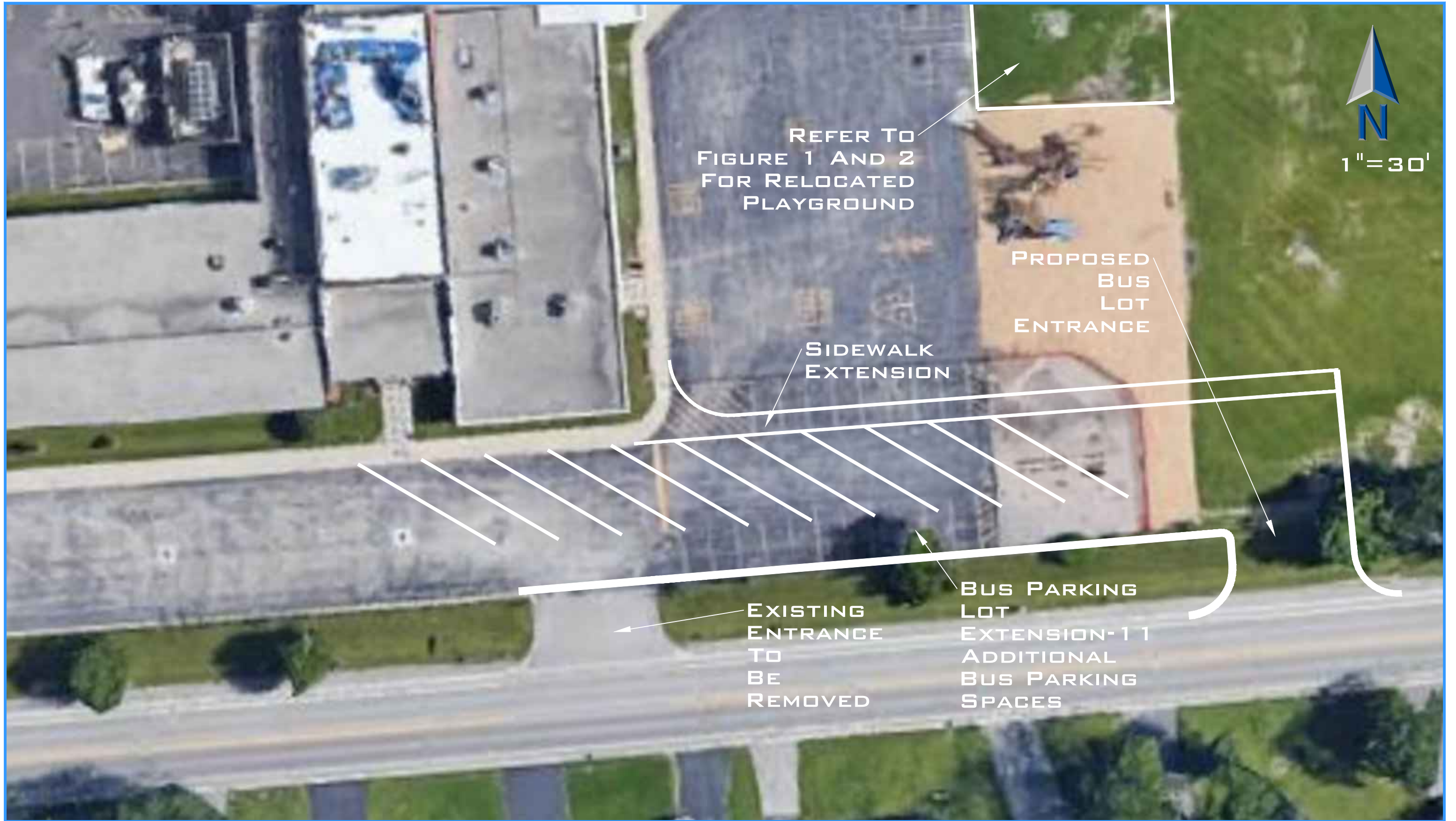
Option 3 - BJ Hooper Elementary School - SE Bus Lot Expansion and Playground Relocation